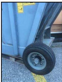
Rear pneumatic wheels