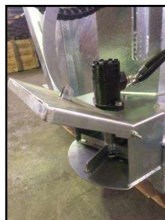
External rotor for side hatch a compost support and similar